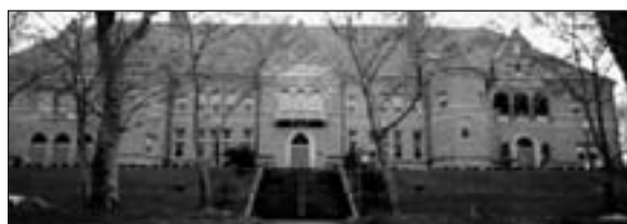
TOP: Statue honoring Col. Anderson is in Pittsburgh’s North Side, outside that neighborhood’s Carnegie Library. Formerly the city of Allegheny, the neighborhood is where the Carnegie family settled after emigrating from Scotland.